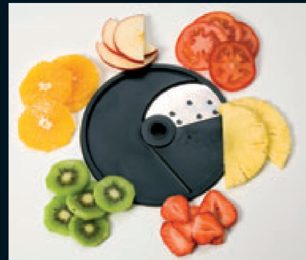
Tomato slicer (TO)