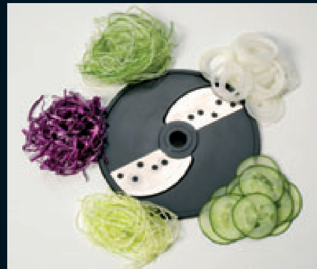
Fine cut (F)