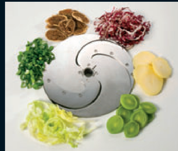
Sickle blade (SM)