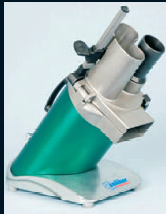
anliker Multicut 240: Processes up to 500 kg per hour. Ideal for caterers, food manufacturers and other large-scale processors.