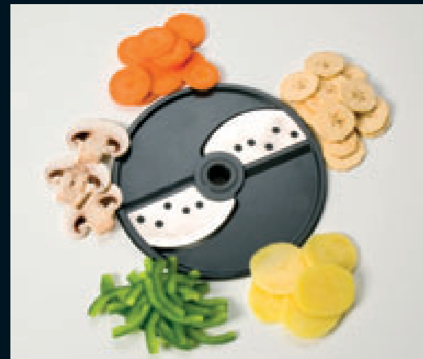
Coarse cut (G)