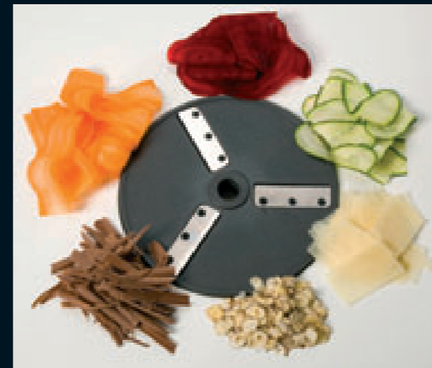
Shaving cut (HS)