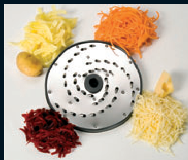
Shredding disc (RS)