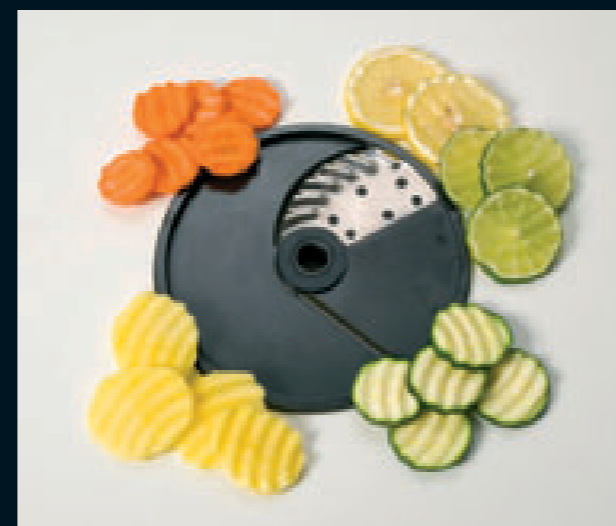
Wave cut (SU)