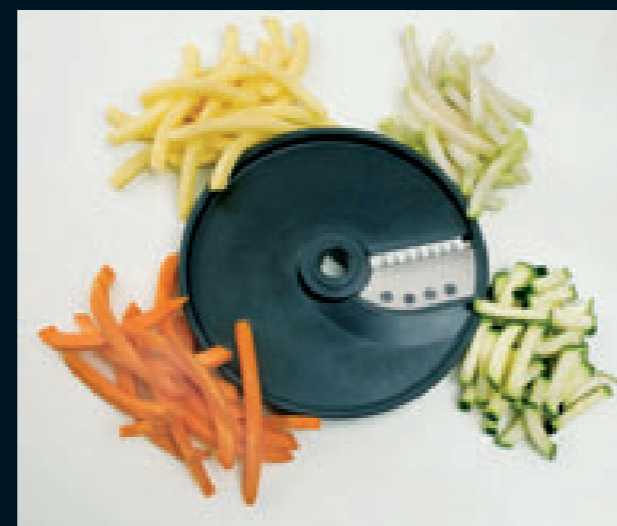
French fries (BT)