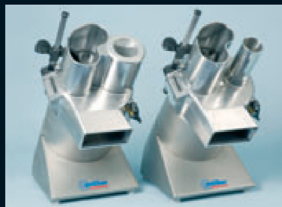
anliker Volume: The anliker5's big sister for large kitchens, canteens and municipal caterers.